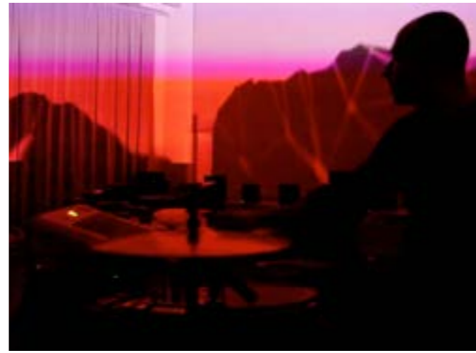
alternative.landscape_v16.11.13 AV Set, Alexander Peterhaensel, 2016