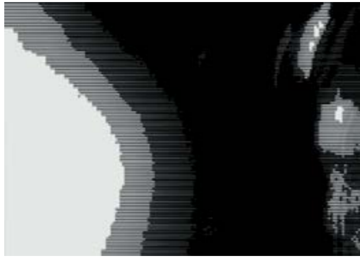
delayscapes AV Set, Marcus Bastos, 2014